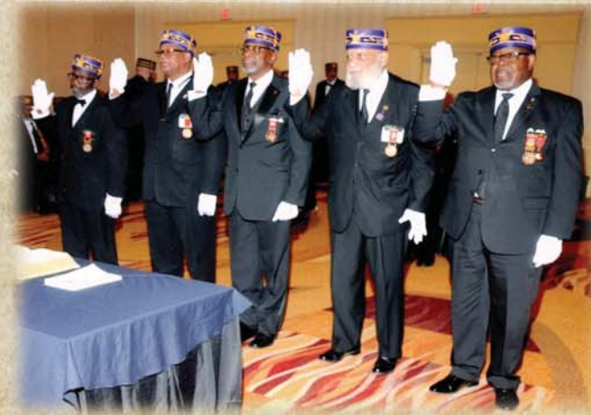
New Jersey Council of Deliberation