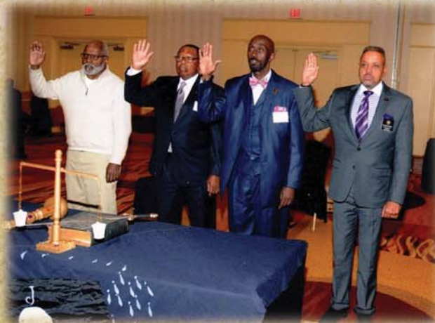
New Jersey Commanders of the Rite