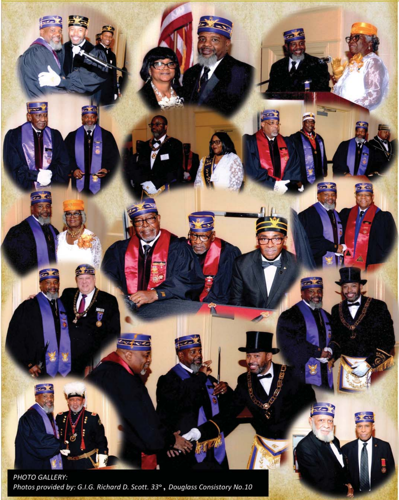
PHOTO GALLERY