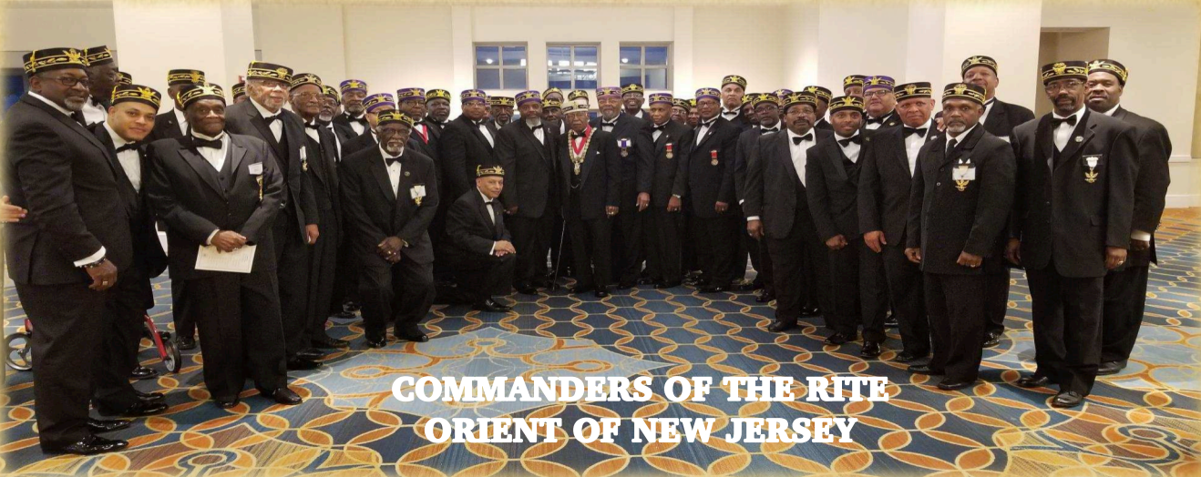
COMMANDERS OF THE RITE ORIENT OF NEW JERSEY