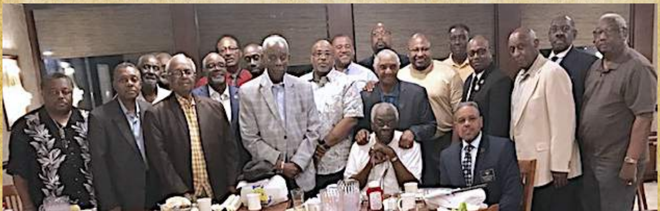
OPHIR CONSISTORY #48 - COMMANDERS OF THE RITE QUARTERLY DINNER MEETING - JUNE 5 2019 MASTORIS DINER, BORDENTOWN, NJ